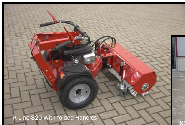
K-Line 820 With folded Handles