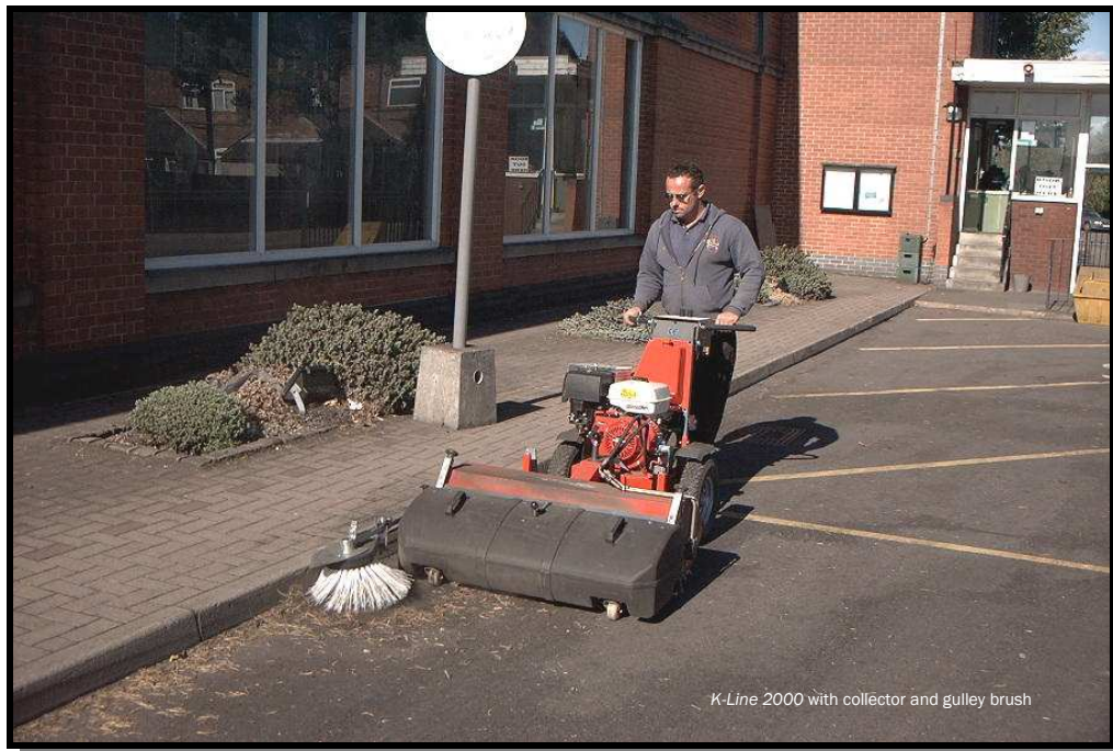
K-Line 2000 with collector and gully brush