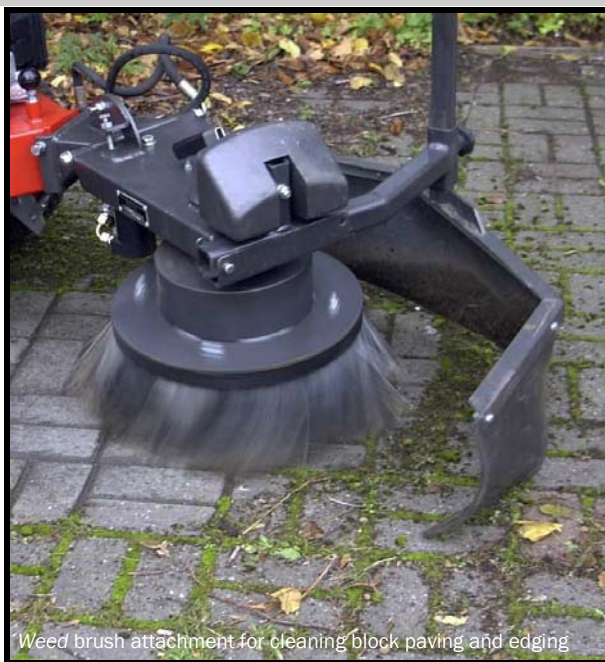
Weed brush attachment for cleaning block paving and edging

75 cm Sweeper 82 cm Sweeper 90 cm Sweeper 1 Metre Sweeper 1.25 Metre Sweeper Collector Spray Guard Gulley Brush Weedbrush Snow Blade Round Brush Dust Suppression Kit Reciprocating Mower Salt/Grit Spreader Trailing Seat Stone Rake Levelling Brush