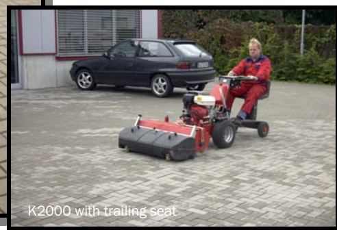
K2000 with trailing seat